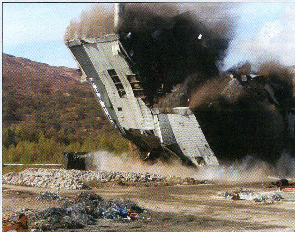
Rock, rubble and roll: An explosion bringing down a 210 ft high powerhouse – part of the former Arjo Wiggins paper mill at Corpach, Fort William – has paved the way for a phased expansion of BSW's existing Fort William sawmill.

• Analysis: Olympic cost pressures hit sustainable materials on p6